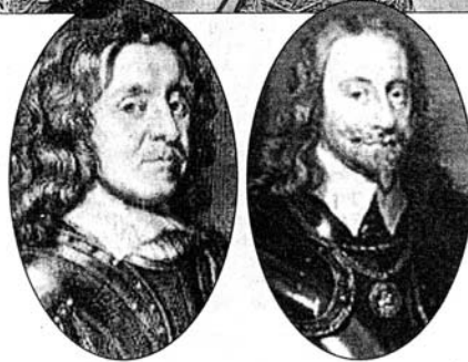
■ The armles of Oliver Cromwell (left) and King Charles I clashed at the Battle of Naseby in 1645

A council spokesman said: "We support any proposals that would improve the experience of visitors to the site. In an ideal world we would love to be more proactive in promoting the site but the reality is that our role is limited and we are involved in an advisory capacity."